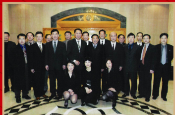
OCEAN members meet with Mr. Tai Hua Wang, Provincial Committee Secretary of Anhui Province OCEAN商务代表团访问安徽-在合肥与安徽省王太华书记等领导合影