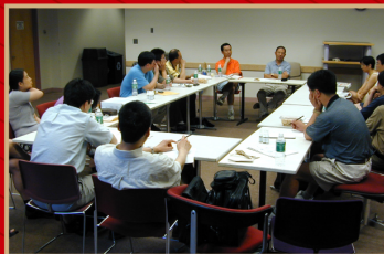
The founder of Nong Fu Spring Inc. talked about how to start your own business at OCEAN meeting 农夫山泉创始人访美，与OCEAN会员座谈创业