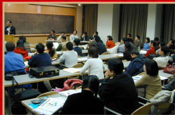
OCEAN Fund Raising Club was established in 2000 2000年OCEAN融资Club成立-每次邀请几位专家做点评