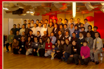
OCEAN MBA reunion OCEAN 历届MBA班大聚会活动