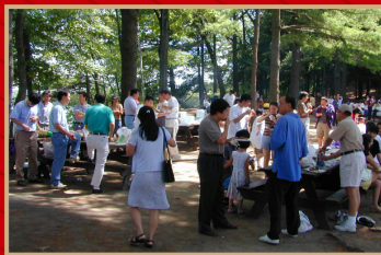
OCEAN outing OCEAN郊外联谊活动