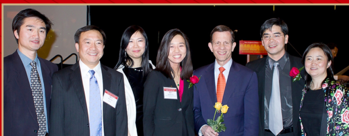
OCEAN members were at Chinese New Year Gala with the President of the Boston City Council. OCEAN 成员在波士顿地区华人新年晚会上与波士顿现议长吴弥合影留念