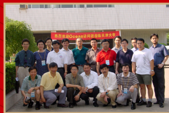
Member of OCEAN Technology Center visited Tianjing University OCEAN科技中心成立，组团访问天津大学