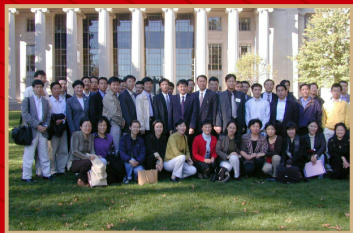
Representatives from Zhong Guan Cun Visited OCEAN at MIT OCEAN接待中关村代表团访美-在MIT合影