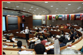
OCEAN Education Center was established OCEAN教育中心成立，接待广州岭南学院EMBA班来哈佛商学院培训