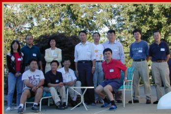
OCEAN MBA club was established in 1999 with professors in Boston Area 1999年 OCEAN负责人和波士顿大学教授们创立了OCEAN MBA Club