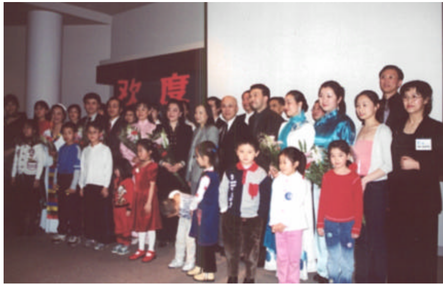
Figure 8: All Actors on OCEAN Annual Meeting