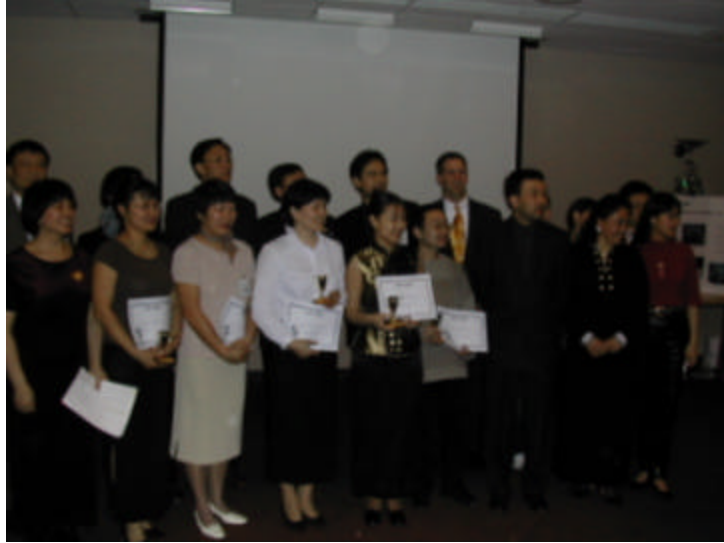
Figure 9: Best Karaoke Singers Received the Awards