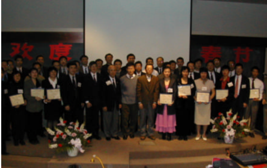
Figure 7: OCEAN's 2 nd Business Administration Training Program Graduation Ceremony