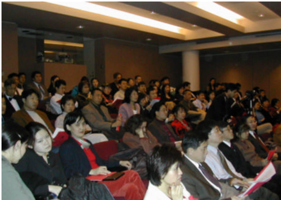
Figure 1: OCEAN 2002 Annual Conference