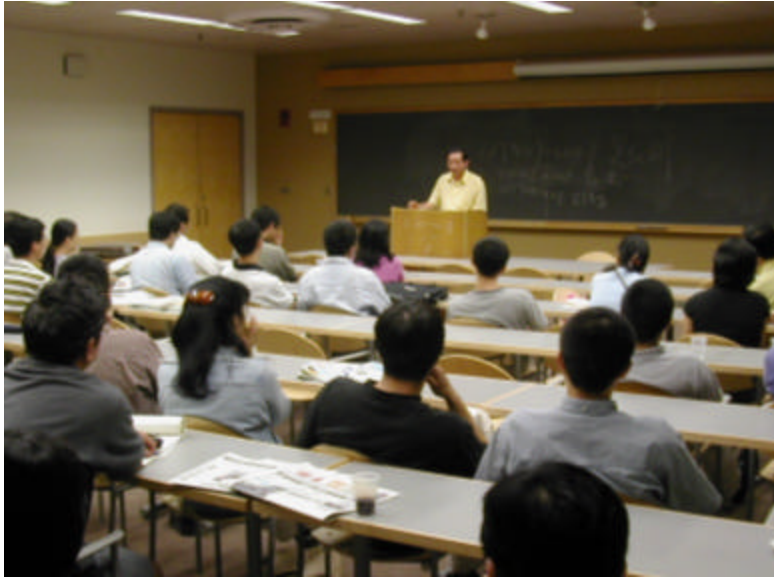
Figure 2: The audiences