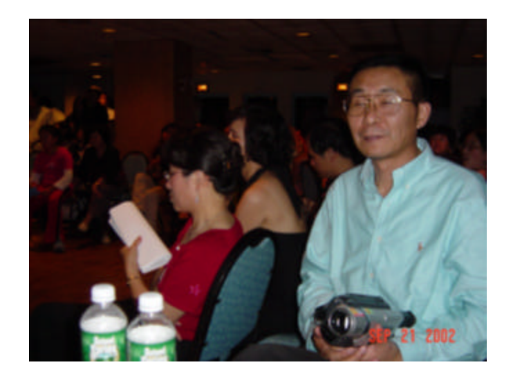
Figure 12. Thinking of Hometown