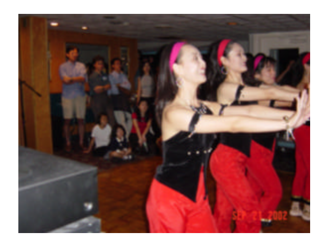
Figure 6. Dancing Performance by Huazhi Dancing Team