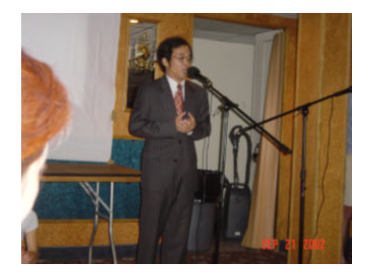
Figure 5. Mr. Bing Hu, the famous Singer, was singing for the audience