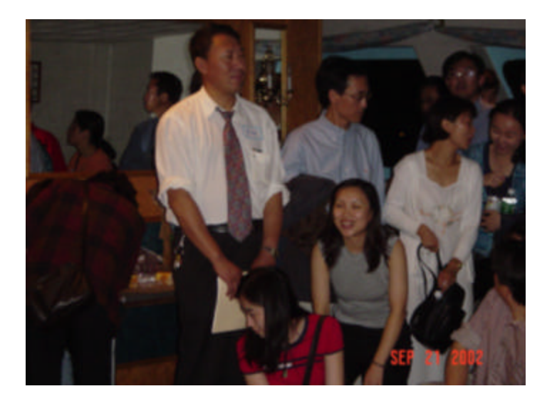
Figure 13. "Let's meet again next year"