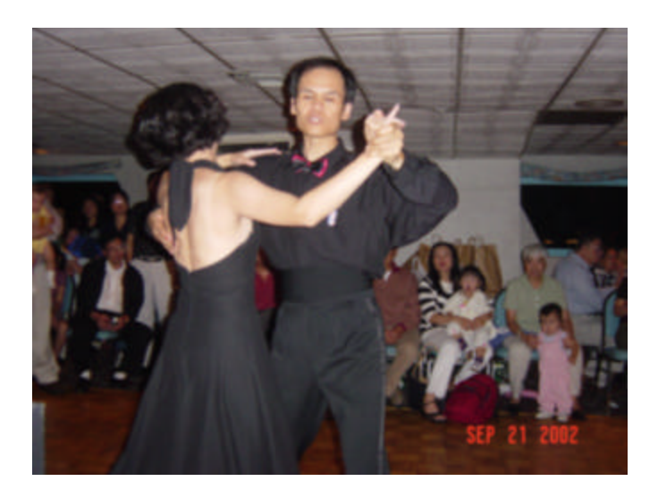
Figure 9. Dancing performance and Dancing Party