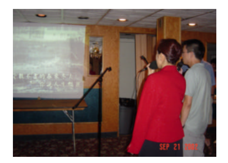
Figure 8. Karaoke on the Ship