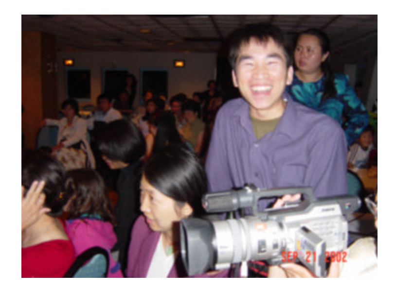
Figure 10. "I am so happy tonight"