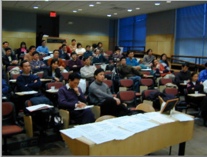
The audiences at the "5-minutes presentation."